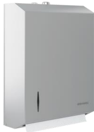
GW03 05 04 01 AISI 304 Brushed