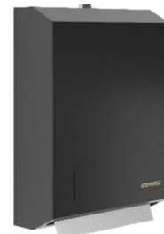
GW03 05 04 03 AISI 304 Matt Black